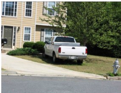
Parking in the Yard

The Code Compliance Division is dedicated to enhancing the quality of life for the citizens of Acworth by providing effective enforcement of City adopted ordinances, housing codes and zoning ordinances. Citizens are encouraged to participate in keeping Acworth a clean and beautiful place to work and play by obeying codes and reporting possible violations, particularly in these areas: